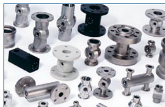
Measuring cells for any application